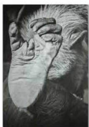
LOT 13: Gorgeous photograph on canvas of Sally's foot. Size: 50cm x 76cm.