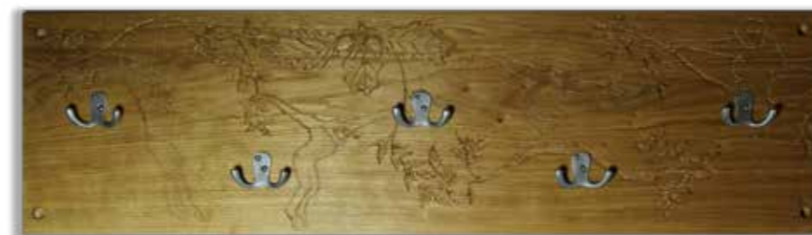
LOT 3: Hand carved wooden coat rack. Beautifully carved coat rack by John Pocock. Size: 100cm x 28cm.