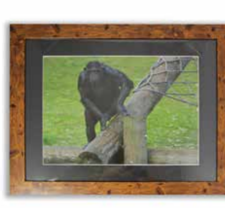
LOT 16: Beautiful framed photo of Peggy Kindly donated by Darren Jones. Size: 58cm x 48cm.