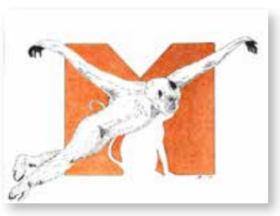
LOT 23: Gibbon/M drawing. Original drawing by John Pocock. Size: 37cm x 30cm.