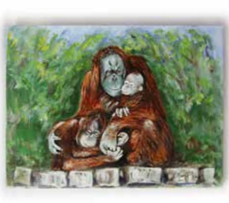
LOT 12: Beautiful original painting on canvas of Hsiao-Quai & family. By P Martin. Size: 60cm x 50cm x 3.5cm.