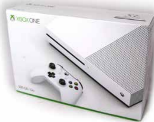
LOT 34: X-Box One.