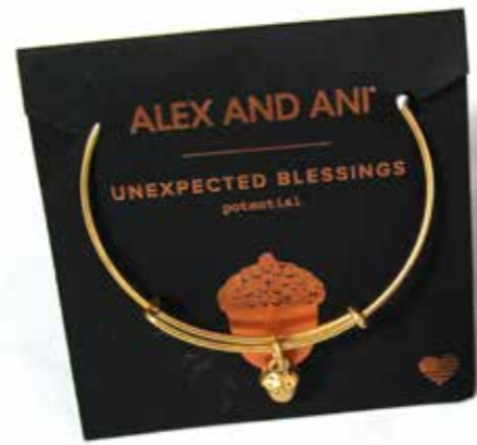
LOT 32: Alex & Ani acorn bracelet.