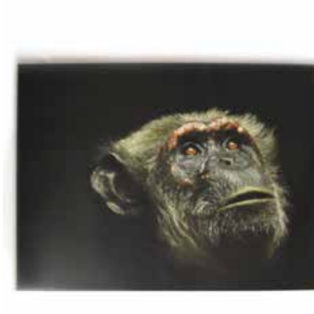
LOT 10: Stunning picture of chimpanzee Zoe on canvas. Size: 56cm x 41cm.