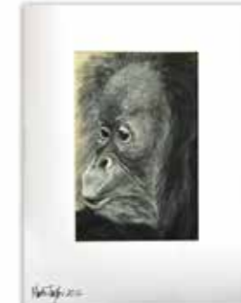
LOT 21 Original 1 of 1 artwork of Silvestre. By Martin Taylor. Size: 59cm x 84cm.