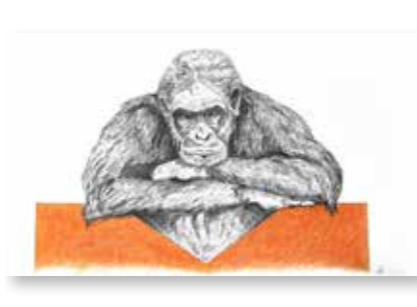
LOT 25: Drawing of Butch. Original drawing by John Pocock. Size: 43cm x 27cm.