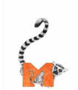
LOT 26: Lemur drawing Original drawing by John Pocock. Size: 30cm x 42cm.