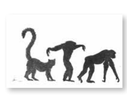
LOT 24: Silhouette drawing. Original drawing by John Pocock. Size: 30cm x 22cm.