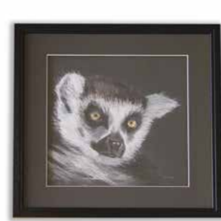
LOT 9: Beautiful original pastel painting of a lemur. Painted and donated by Ros Rouse. Size: 50cm x 50cm.