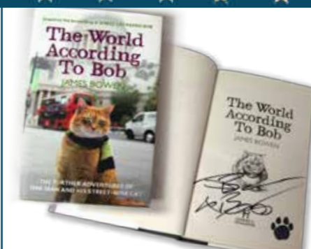
LOT 28: 'The World According to Bob'. Hardback book. Signed by author James Bowen.