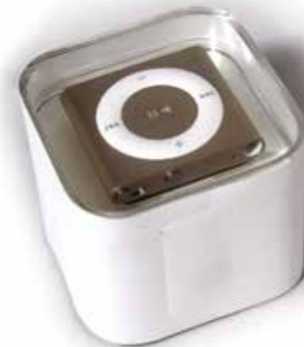
LOT 35: 2GB iPod Shuffle.