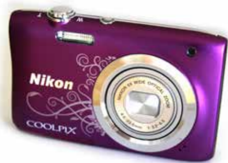
LOT 33: Coolpix A100 Nikon digital camera.