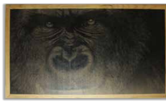
LOT 20: Unique halftone carved image of a chimp. Kindly donated by Halcyon. Size: 91cm x 54cm.