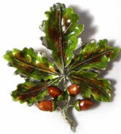
LOT 31: Vintage enamel oak tree leaf brooch. By Exquisite. Size approx. 8cm x 6cm.