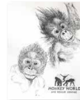
LOT 22: Bulu & Rieke drawing. Original drawing by John Pocock. Size: 30cm x 42cm.