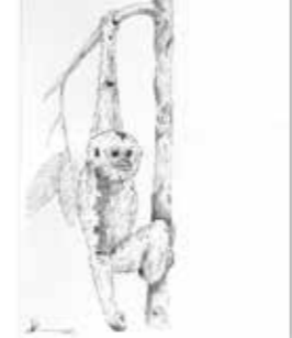
LOT 27: Gibbon drawing. Original drawing by John Pocock. Size: 20cm x 30cm.